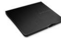
Portable USB DVD Writer