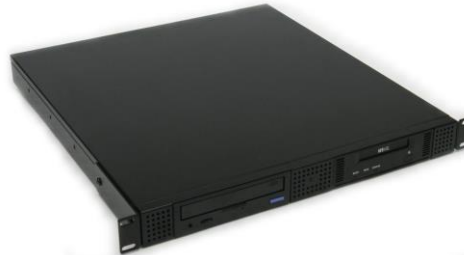
SCSI Media Kit, Rack-Mount Model