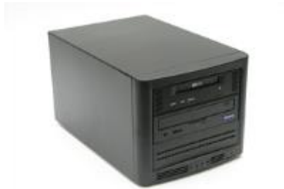
SCSI Media Kit, Desktop Model